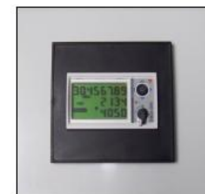
Front view of the instrument mounted on a panel