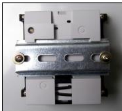
Back view of the instrument mounted on a panel